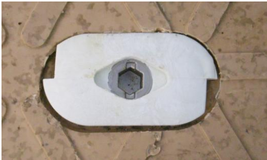
Fig 20 Pin in locked position