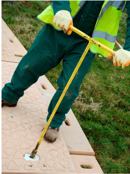
Fig 19 Use T bar to turn pin to lock