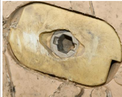
Fig 21 unlocked

Repeat this until the crane has reached its limit, in terms of reach. Place the crane over the mats on the truck, Fig22 lift the stabiliser legs and slowly reverse the truck so that the rear bumper is just past the last mat by around 300mm. This will allow the laying of 4 mats in line without moving the truck again. Fig23