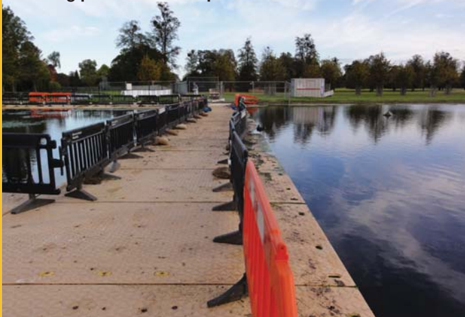
Floating pontoon at Hampton Court