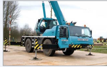
High point loading - no problem